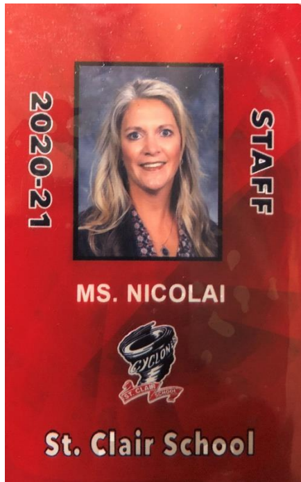
St. Clair Staff ID